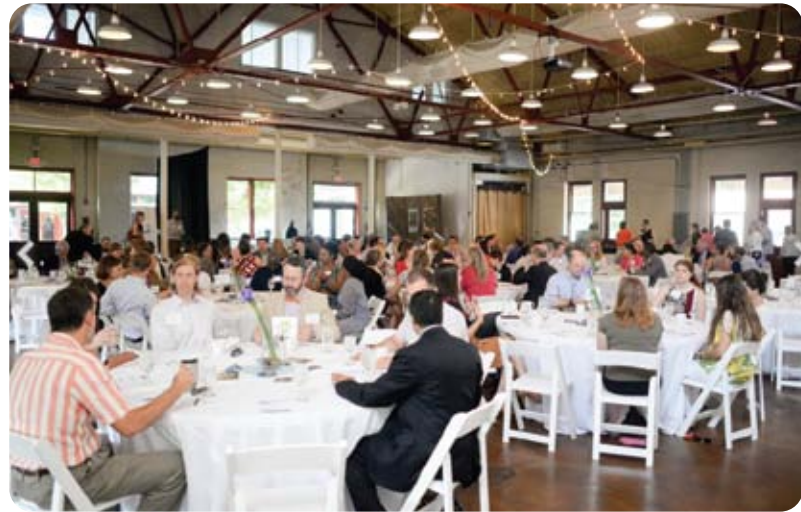
Over 120 Triangle business and conservation leaders gather at City Market for the annual Earth Day Breakfast