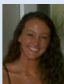
Aerial Hall ELON UNIVERSITY

We would like to thank the following interns for their service this past year: